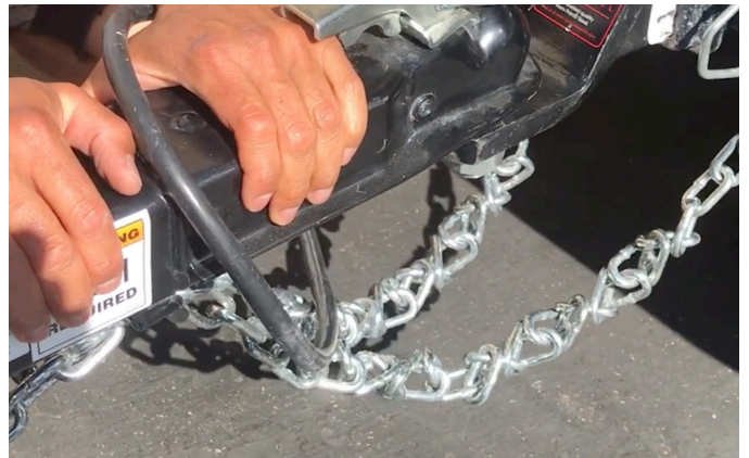
Do a safety check before you leave to make sure everything is connected and ready to go!

Once you've followed each of these steps and double-checked that everything is in place, it's time to hit the road!