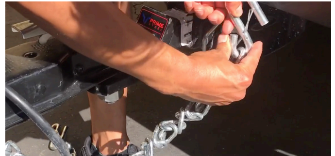
Twist safety chains before attaching them to the trailer hitch.

Next, connect the two safety chains to your vehicle. The chains should be crossed underneath the trailer coupler then clamped to your hitch. If necessary, twist the chains a few times to shorten them so they don't drag. Ensure the chains have enough length to account for any turns. They should have a slight curve to them and not be straight when connected. Connect the smaller emergency breakaway cable to your vehicle using the carabiner.