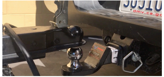
Align and lower coupler onto the trailer ball.

Important: Ensure the latch pin is inserted and secured so the coupler stays closed. You can verify that the latch is locked-in by lifting and shaking your camper's tongue. If it is attached well, the coupler will stay connected to the ball.